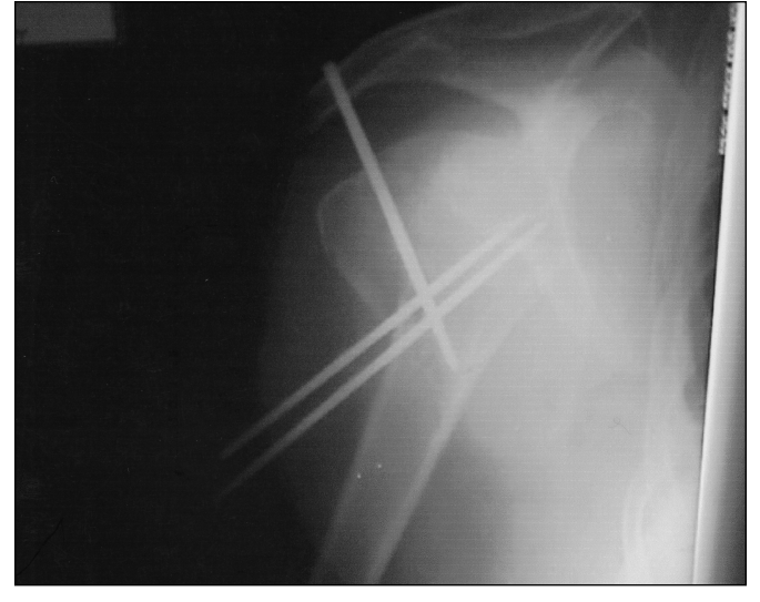
Figure 1. Original X-ray of pin placement.

The Laparoscopic Retrieval of an Orthopedic Fixation Pin from the Liver with Repair of an Associated Diaphragmatic Laceration, Antonacci AC et al.