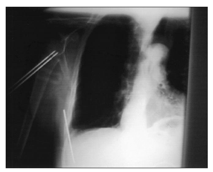
Figure 2. Post pin migration X-ray.

demonstrated a 9.6 cm metallic foreign body representing one of the fixation pins transiting the right chest and entering the right lobe of the liver in a postero-lateral oblique angle. The tip of the pin appeared confined to the liver at the time of the examination. The patient was taken to the operating room for a planned laparoscopic exploration.