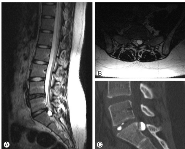
Fig. 3. A 17-year-old woman with symptomatic discal cyst. A and B : T2-weighted sagittal and axial magnetic resonance images reveal the discal cyst. C : Computed tomographic scan after discography confirms the cyst connected to L5-S1 intervertebral disc.

tear was noticed in one patient as an attempt was made to dissect the adhesion with the dura. Dural repair by artificial dural graft was performed, and fibrin glue was injected. There was no sign of persistent cerebrospinal fluid leakage and meningocele. There was no evidence of the recurrence of cyst during the follow-up period. Histological examination of the cysts in 7 patients revealed fibrous connective tissue without evidence of epithelial lining cell or disc materials (Fig. 1, 2, 3).