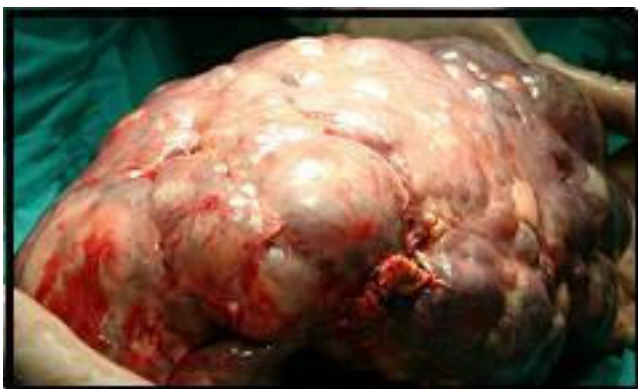
Figure 3 Intraoperative view of the cystic lenfangiomas in the spleen.

Parasitic and non-parasitic cysts of the spleen have a very similar clinical presentation, but due to their differences in diagnosis and treatment, it is important to distinguish the two. The majority of splenic cysts, both parasitic and non-parasitic, are found incidentally on imaging [4]. Splenic cysts grow slowly and are characterized by a long period of asymptomatic latency, such that initial diagnosis is usually established during the course of investigations carried out for other diseases. When the cyst reaches a considerable size, its clinical presentation is normally a result of pressure on adjacent viscera, and may include renal arterial compression with systemic hypertension,