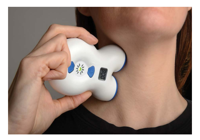
Figure 1 Positioning of the non-invasive vagus nerve stimulation device.

The vagus nerve plays a key role in regulation of nausea and vomiting,<sup>19</sup> and there is evidence of vagus afferent effects on nociception,<sup>20</sup> which suggests that electrical neurostimulation modulates nausea and vomiting. The current proof-of-concept study explored the possibility that non-invasive vagus nerve stimulation (nVNS) could have clinical effects similar to those of an implanted GES device in patients with gastroparesis. nVNS was delivered by a batterypowered neurostimulator (gammaCore, electroCore; Basking Ridge, New Jersey, USA) designed primarily to stimulate myelinated sensory afferent vagus nerve fibres as they ascend through the neck in the carotid sheath (figure 1). The device has been approved and is being prescribed in several countries mainly for the