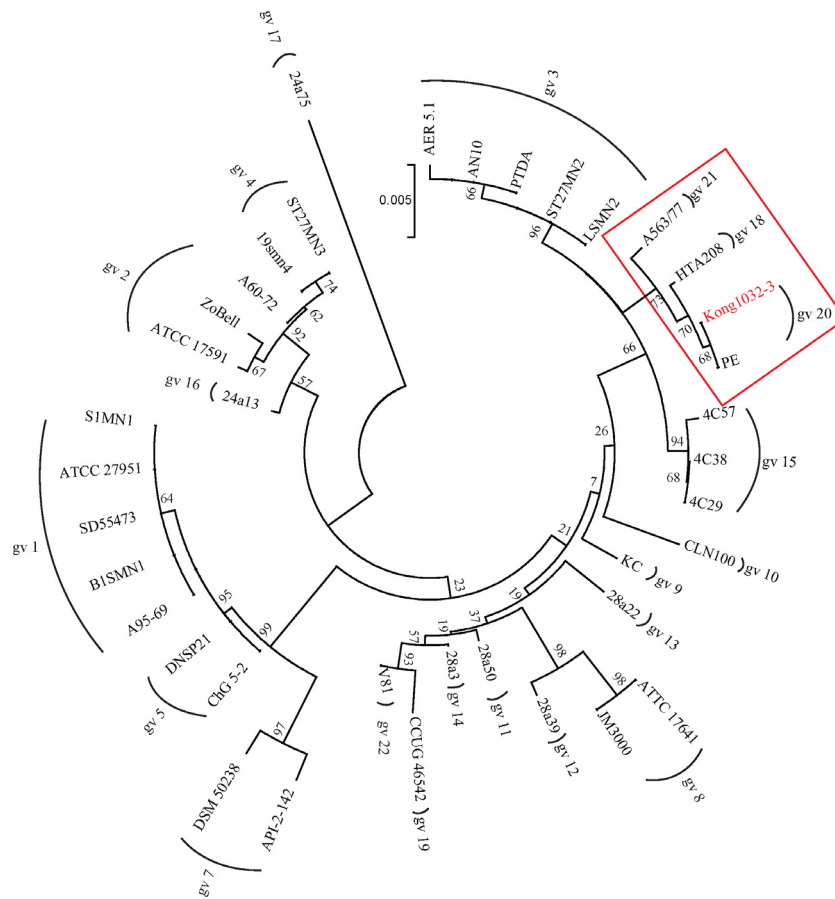
Figure 1. Phylogenetic tree of all 37 Pseudomonas stutzeri strains representing the established genomovars 1–22 based on the analysis of 16S rRNA gene. The evolutionary distances were computed using the Maximum Composite Likelihood method. The bootstrap test (1000 replicates) are shown next to the branches. Dendrograms were generated using neighbor-joining method. Clone of K1032-3 is clustered to gv 20 clearly.

and not a single strain was reported from the environment associated with oil reservoirs (Table S1).