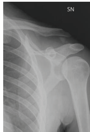
FIGURE 1: Radiograph (AP view) of a 34-year-old male showing an ACJ dislocation complicated with a fracture of the lateral third of the clavicle.

A total of 108 patients, with a mean age of 37.5 years (range 13–69, SD 13.6), were diagnosed with AC dislocation in the selected 5-year period. Out of these patients, 105 (97.2%) had an isolated AC dislocation, and 3 (2.8%) were associated with a clavicle fracture. In two cases, the fracture involved the