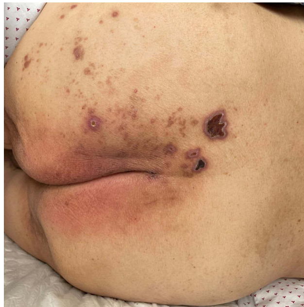
Figure 1 Classic shingles appearance in the S2–S4 distribution of the buttock.