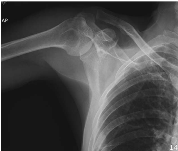
Figure 1. Preoperative anteroposterior X-ray showed CP fracture and a third-degree AC joint separation.

weight on that arm for 6 weeks after surgery. The range of motion of the shoulder was limited to 45° abduction and 90° forward flexion. After 6 weeks, the patient was permitted to begin progressive active activities. Muscle exercises began at 8 weeks.