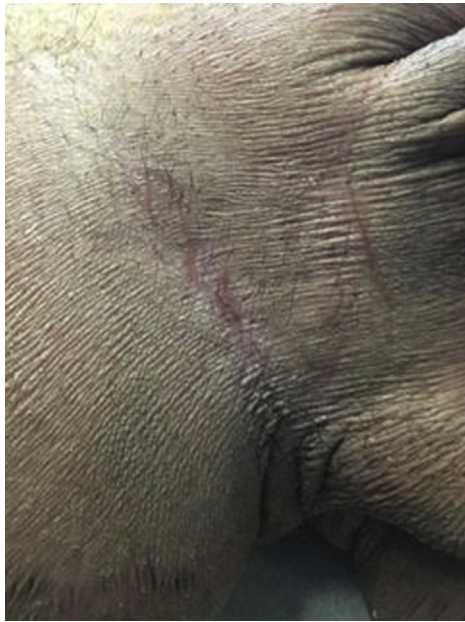
Fig 1. Atrophic, erythematous, fissured plaques in the inguinal fold on the right side.

immunofixation; elevated free \kappa (20.9 mg/L), normal free \lambda (8.27 mg/L), and increased \kappa/\lambda ratio (2.53) of serum immunoglobulin free light chains; normal lactate dehydrogenase and C-reactive protein levels; and negative blood EBV polymerase chain reaction. Whole-body positron emission tomography/computed tomography showed multiple sites of moderate to intense fluorodeoxyglucose avid disease, including lymph nodes in the neck, bulky bilateral lingual tonsils, and lymph nodes in the pelvis.