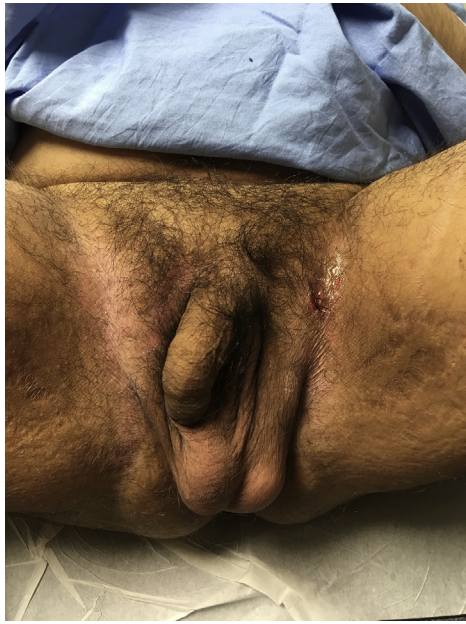
Fig 4. At 10 months after topical imiquimod therapy and reduction in immunosuppression, there is no clinically evident sign of cutaneous PTLD (inguinal fold on the left side is the site of repeat biopsy).

evidence suggests that plasmacytoma-like PTLD has a favorable outcome compared with other types of PTLD. 19 The 2017 World Health Organization classification separates PTLD into 6 main pathologic types: plasmacytic hyperplasia, infectious mononucleosis, florid follicular hyperplasia, polymorphic PTLD, monomorphic PTLD, (including both B-cell and T-cell neoplasms), and classic Hodgkin lymphoma. 20 Plasmacytoma-like PTLD is a monomorphic B-cell PTLD subtype that is typically CD20 - .