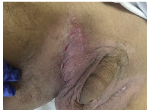
Fig 3. Significantly increased erythema and inflammation in the inguinal region on the right side after 3 months of therapy with imiquimod 5% cream.