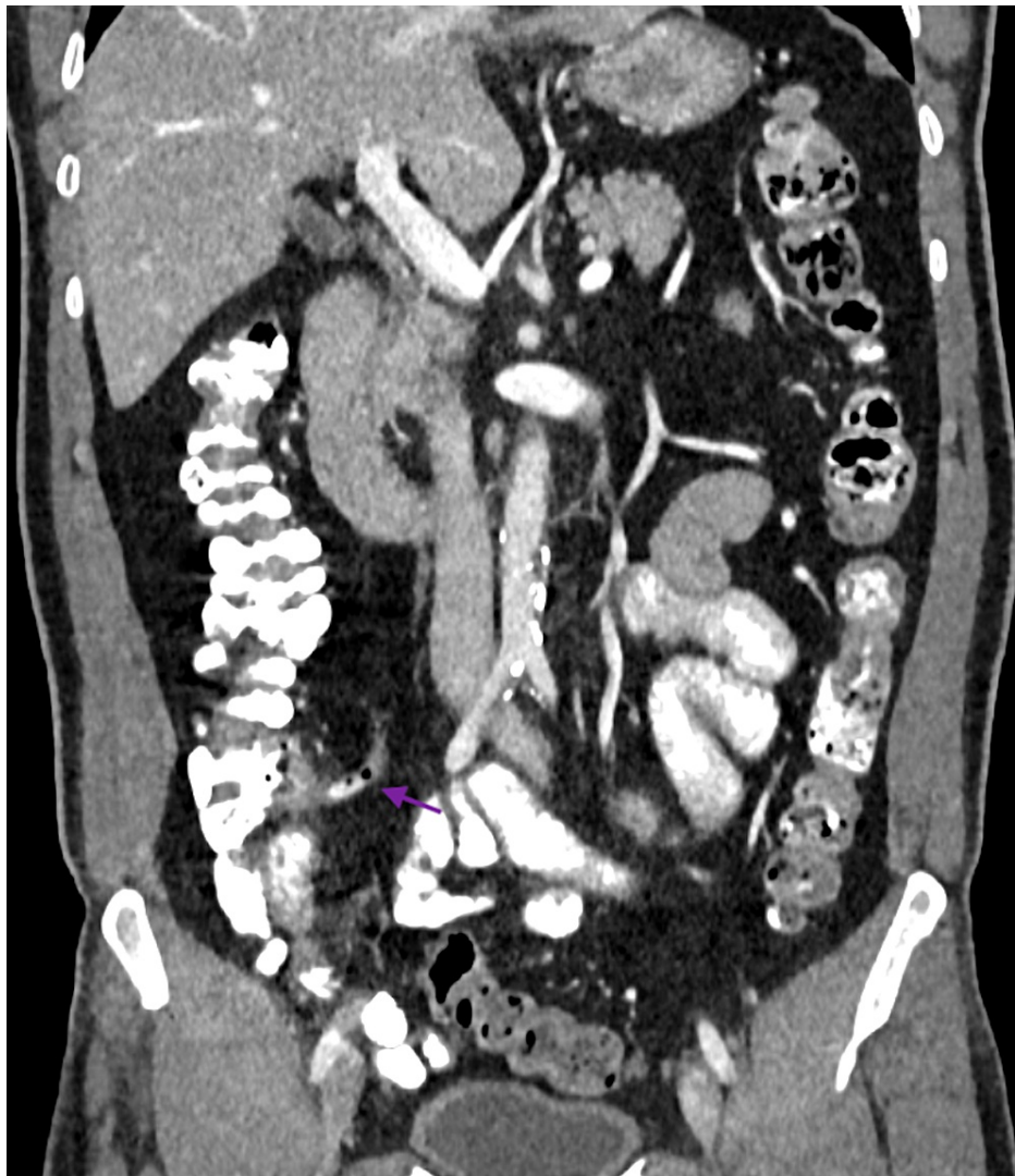
FIGURE 2: Coronal section of contrast-enhanced CT abdomen showing normal appendix (purple arrow) with intraluminal air and contrast.