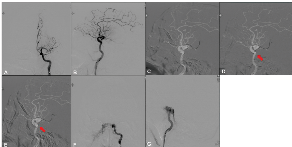
Fig. 1 Mechanical thrombectomy: (A, B) Left ICAG revealing a left M2 proximal occlusion. (C) The microcatheter was advanced over a microwire. (D, arrow) The shape of the microcatheter changed significantly in the syphon portion of the ICA. (E, arrow) The body of the microcatheter perforated the ICA wall and went into the cavernous sinus. (F, G) Left ICAG revealed a direct CCF. Shunt flow was abundant and ascending blood flow to the brain diminished. This complication halted the thrombectomy.

The second intervention was planned as a parental artery occlusion because of the large fistula size. Left ICAG showed