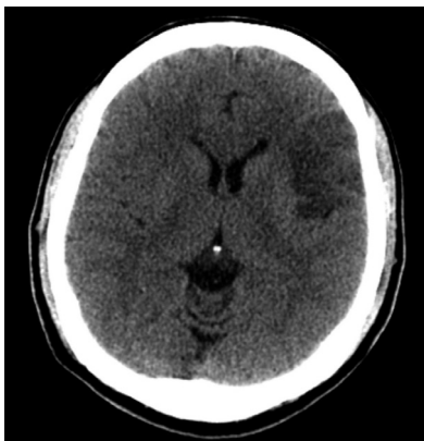
Figure 1. Cranial Computed Tomography in axial section showing hypodense area in the left inferior frontal gyrus topography.

Three years later, the same author reported two similar cases exhibiting constructional apraxia, anomia for colors and difficulty reading numbers but not words. 4