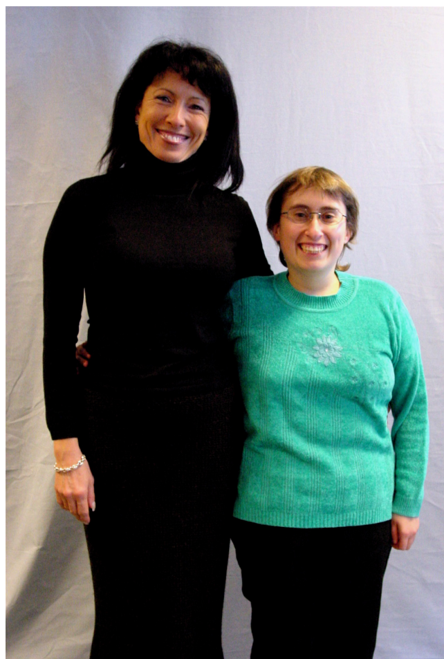
Figure 1 Short statured Patient with only little overweight according to regular exercising. This 24 year old woman with PWS is short statured, compared to her mother next to her on this picture. She has been very obese, while under brace treatment, however with good intake control of food, regular exercising and after having gone through 3 phases of in-patient rehabilitation during the time of brace treatment, she does not seem to be overweight now.

Patel et al demonstrated that PWS patients may have significantly raised levels of the inflammatory marker hs-CRP and evidence of microcirculatory dysfunction, both of which are associated with coronary artery disease and