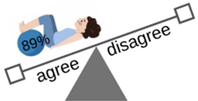
Figure 2 Perceived knowledge of the basic principles of Evidence-based Practice: patients' values, clinical expertise and scientific literature. EBM, Evidence-based Medicine.

In your opinion, the scientific literature is useful in your clinical practice? (item 20)