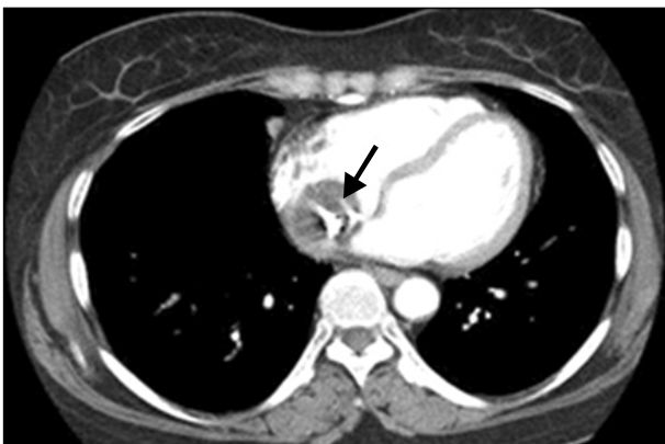
Fig. 1. Computed tomography image of right atrial cystic mass. The arrow shows the calcified mass in the cyst.

The close relationship between Chiari's networks and patent foramen ovals (PFOs) has been well documented [4]. According to Schneider et al. [4], PFO was detected in 83% of patients with Chiari's networks compared with 28% of controls. However, in patients with Chiari's network, a PFO was significantly more common in arterial embolic events [4]. They also found that right-to-left shunting of a PFO was significantly more common in patients with Chiari's network than in control patients [4]. For this reason, PFOs may be