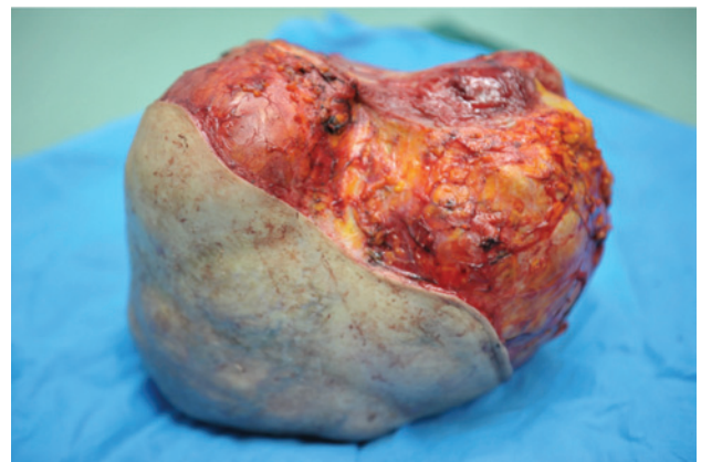
Figure 2. Resected Phyllodes tumor (PT) weighing 11 kg and measuring 36x40x18 cm.