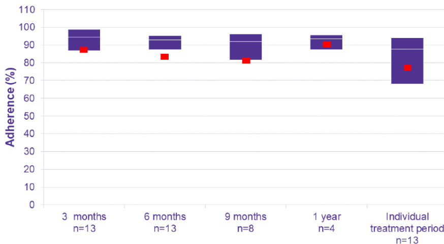
Figure 2. The proportion of patients treated with growth hormone using easypod with adherence rates of at least 80% over time and for all patients at any time within the study period.