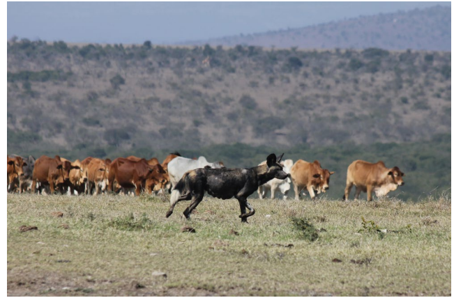
FIGURE 1 An African wild dog ( Lycaon pictus ) passes a herd of cows in Laikipia, Kenya.

One species that has been found to change its behavior at high temperatures is the African wild dog, Lycaon pictus (Figure 1). The African wild dog is a highly social species of canid that historically lived throughout much of sub-Saharan Africa; however, today the species is restricted to just 7% of its historic range (Woodroffe &