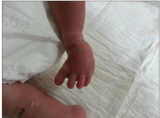
Figure 2: Clubfoot of left lower limb