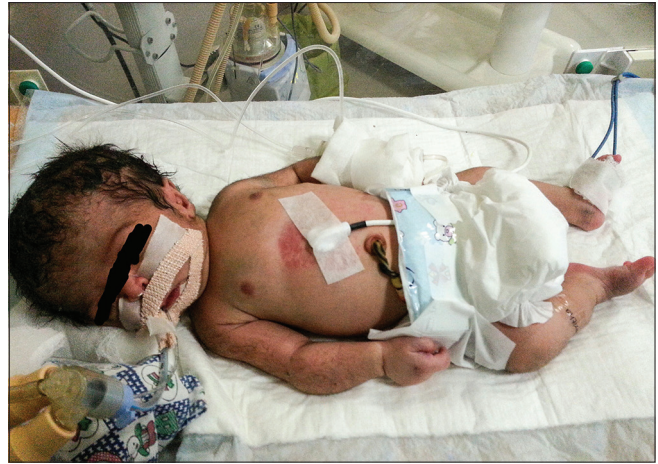
Figure 1: Baby with short and bent limbs, small chest, short neck, and macrocephaly

Shortness of the calf and hamstring musculature causes bowing of the tibia and femora and characteristic skin dimples over the curved bones, especially the lower limbs. They usually have short legs, dislocated hips,