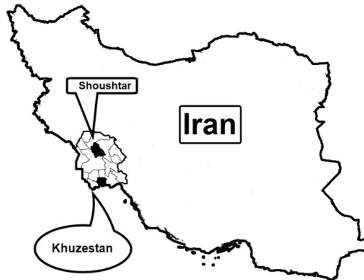
Fig. 1. The area of this research is Shoushtar County (Khuzestan Province) in Iran's southwest 2015