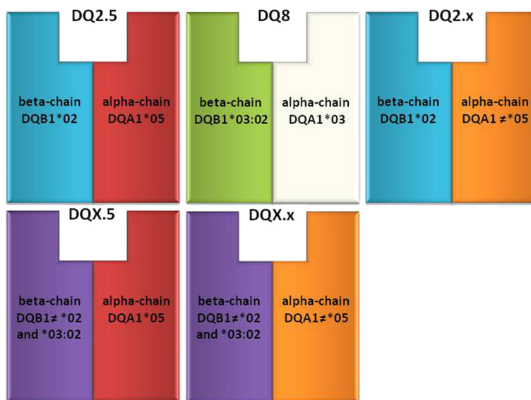
Figure 1 CD at-risk DQ heterodimers encoded by different combinations of DQA1 and DQB1 alleles.

celiacs are frequently male [14]. Figure 1 summarizes the different DQ glycoproteins with regard to the CD-predisposing alleles.