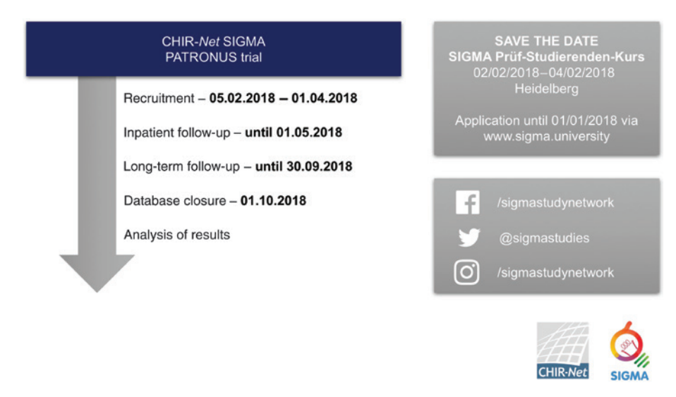
Figure 3: At a glance: the CHIR-Net SIGMA network.

will be the first clinical trial initiated and led by the CHIR-Net SIGMA network Figure 3. Its objectives include determining the association between short-term (postoperative) complications and long-term clinical outcomes (survival) and PROMs. Two sets of PROMs will be used in the PATRO-NUS trial: (a) a core set of 12 cancer-associated symptoms measured via the newly developed Patient-Reported Outcomes version of the Common Terminology Criteria for Adverse Events (PRO-CTCAE) [24] and (b) cancer-specific quality of life (measured via the computer adaptive testing version of the EORTC QLQ-C30). These will be adjusted for patient-specific factors, the type of malignancy, and its associated surgical procedure. The study is designed as a prospective multicenter observational cohort study across Germany. The study will recruit from all active SIGMA sites at that time, and the inclusion of first patient (FPI) is planned for February 2018.