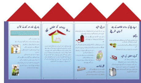
FIGURE 3: Example selections from Educational Pamphlet in Urdu.

3.2. Educational Pamphlet. The goal of the educational pamphlet was to provide childhood safety prevention information in a format not requiring the presence of a health practitioner for understanding or use. The study team reviewed existing injury prevention materials from HICs, including pamphlets and fact sheets on burns, falls, and drowning, similar to those available from the United States’ Centers for Disease Control and Prevention [30].