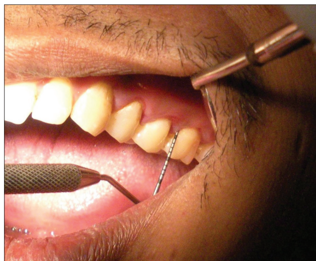
Figure 4: Measurement of probing depth after 1 month

SRP + MET (Group A), whereas in the patients treated SRP alone (Group B), the values were about 50%, 71%, and 71%, respectively, which shows that the formulation containing MET was significantly better.