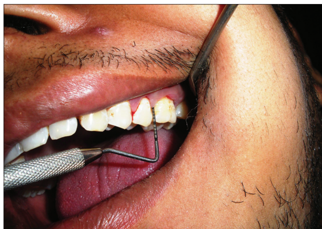
Figure 2: Measurement of probing depth at baseline

Group A was treated with SRP + MET and Group B with SRP alone. At the end of the observation interval (i.e. 15 th and 30 th day), all sites got healed unevenly. The mean values for PD, PI, and GI score were measured at 15 th and 30 th days following treatment. The percentage reduction in PD, PI, and GI scores from baseline was 68%, 85%, and 90%, respectively, in the patients treated with