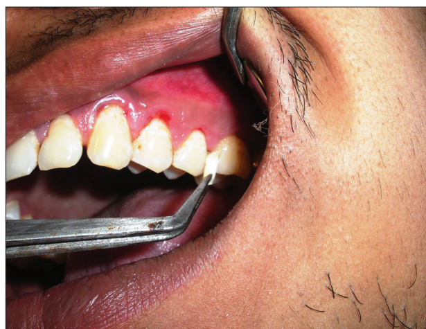
Figure 3: Insertion of the nanofiber into the pocket