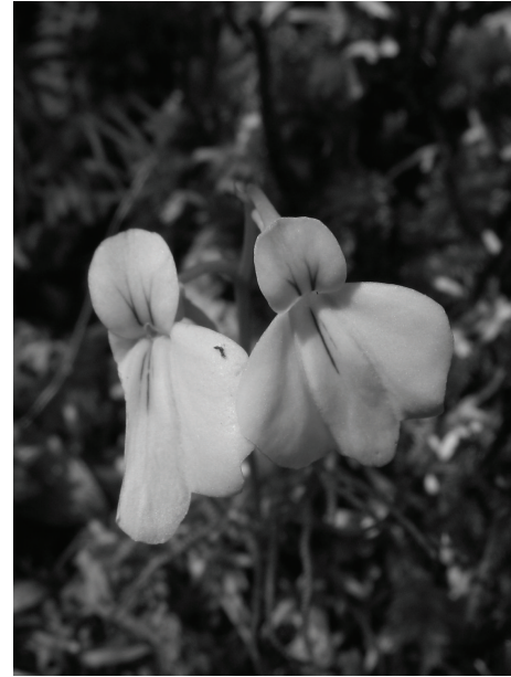
FIGURE 2: Utricularia vitellina —the endemic montane species of Peninsular Malaysia.

The distribution pattern of the genus (Figure 3) illustrates that diversity hotspots are centred in small isolated mountain massifs. Gunung Jerai, Kedah, topped the list with seven species, followed by Gunung Ledang, Johor with five species. The endemic U. vitellina is restricted to one type of