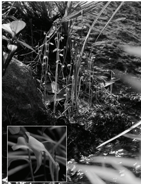
FIGURE 1: Utricularia bifida —the most common terrestrial species often found along waysides.

*adapted to suit the geographical range and demographic details on population of the Taxon Data Information Sheets modified from the IUCN Red list assessment questionnaire, as recommended by the Malaysia Plant Red List guidebook [9].