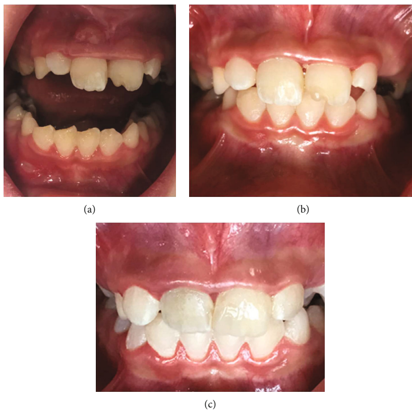
FIGURE 1: (a) Mucosal sinus tract on the maxillary right central incisor. (b) Four-month follow-up. (c) Fourteen-month follow-up.