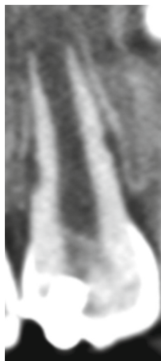
FIGURE 3: Coronally sectioned CBCT image indicating evidence for external root resorption.