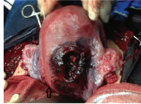
FIGURE 2: Artery was sutured with Vicryl 1.0. Arrow indicates incision side of the uterus.

In 1950, the largest published series, a review of 75 cases due to utero-ovarian vessel rupture, reported a 49% of maternal mortality; however mortality rate declined to 3.6% by subsequent developments in medicine [1, 3]. Even though hemoperitoneum caused by utero-ovarian vessels rupture may occur in all trimesters, it mostly occurs in the third trimester; 61% occurred before labour, 18% was intrapartum, and 21% was in the puerperal period [3, 4]. Suggested etiologic factors are dilated utero-ovarian veins which have