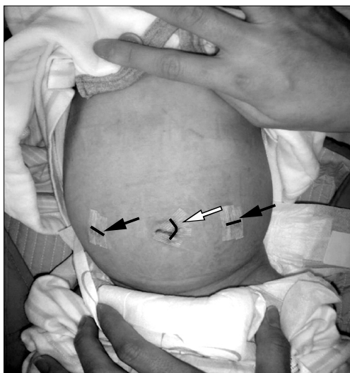
Fig. 2. This picture shows surgical incisions. A camera port (white arrow) was made at the umbilicus, and another two ports (black arrows) were placed at the same level. White arrow: skin incision for 5 mm trocars. black arrow: skin incision for 10 mm trocar.

guinal ring was repaired with a 3-0 black silk purse-string suture. There were no complications during the operation. The patient was discharged uneventfully on postoperative day 7. At the 1 year follow-up, there was no recurrence of the hernias.