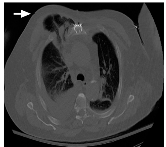
Figure 2 Axial CT showing lung herniation through the costochondral fractures (arrow) after sternal ORIF.

cartilages. Meticulous dissection allowed for reduction of most of the herniated lung. An infraclavicular counter incision was required to fully reduce the lung. With the lung fully reduced, additional fractures of the fourth and fifth costal cartilages were visualized. With the sternal plate in place, there was no margin laterally on the sternum to secure hardware. In view of the significant injury to the sternum and the adequacy of the current sternal plate, the decision was made to place a Vicryl mesh in underlay fashion and stabilize the fractured cartilages using resorbable stabilization