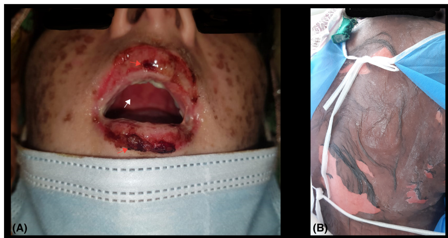
FIGURE 1 (A). White arrow showing red and inflamed oral mucosa. Red arrows show dark, crusted lesions on lips. (B). Showing areas of skin detachment on the back

Abbreviations: ALT, alanine transaminase; APTT, activated partial thromboplastin time; AST, Aspartate transaminase; CRP, C-reactive protein; ESR, Erythrocyte sedimentation rate; Hb, hemoglobin; LDH, lactate dehydrogenase; PT, prothrombin time; TLC, total leucocyte count.