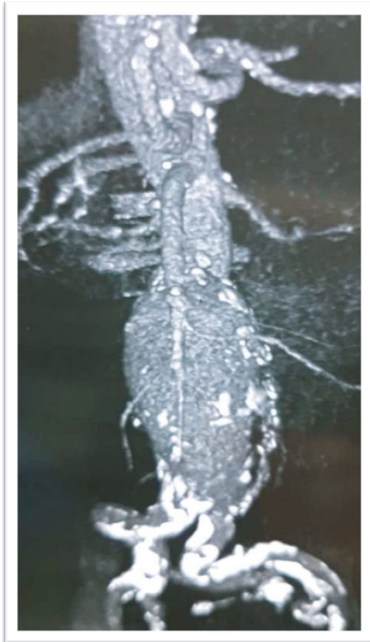
FIGURE 1: Abdominopelvic CT scan without contrast before AAA repair operation.

had been discharged with serum creatinine 1.6 mg/dl and had been stable over these 4 months. Renal functional scan (Tc-99m DTPA (diethylene-triamine-pentaacetate)) was normal. Past medical history was positive for hyper-