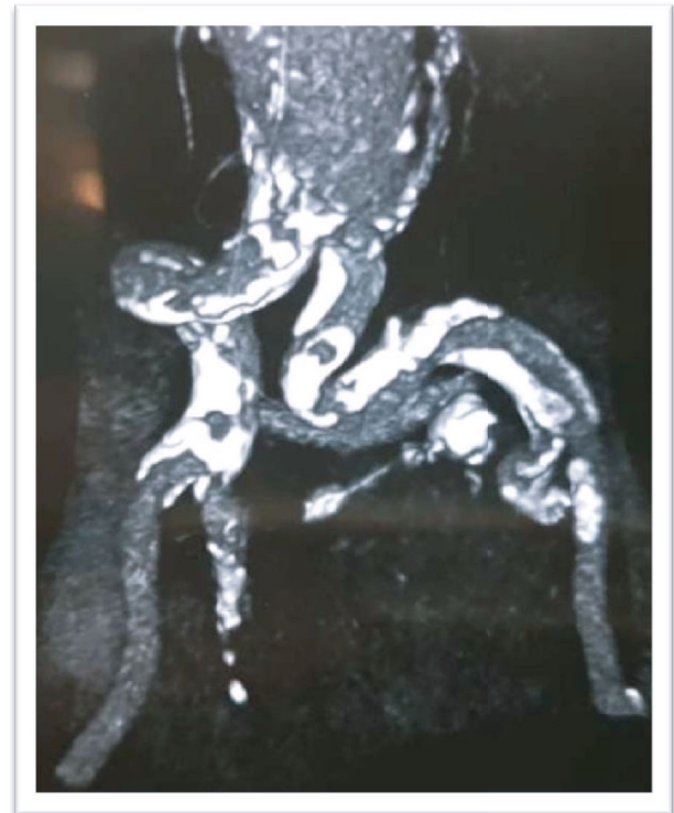
FIGURE 2: Abdominopelvic CT scan without contrast before AAA repair operation.

had been discharged with serum creatinine 1.6 mg/dl and had been stable over these 4 months. Renal functional scan (Tc-99m DTPA (diethylene-triamine-pentaacetate)) was normal. Past medical history was positive for hyper-