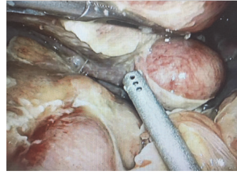
FIGURE 3: The uterine fundus is seen on the right hand side of the image. The pyomyoma is at the top of the image.

Pyomyoma is a rare complication of leiomyomata and is generally seen in the context of pregnancy, postmenopausal status, or uterine instrumentation. This case is a rare exception, as the patient had no recent uterine instrumentation, was nulligravid, and had no reason to exhibit vascular compromise. No records were available from the time when her diagnosis of fibroids was made, so the size of her fibroid at the time of diagnosis is unknown. It is possible that she had rapid growth of the fibroid leading to ischemic changes, degeneration, and subsequent seeding with normal vaginal flora.