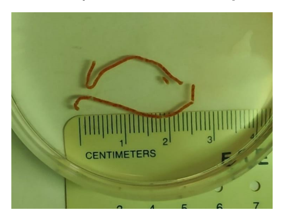
Figure 1. Two visible liver core specimens following EUS-LB.