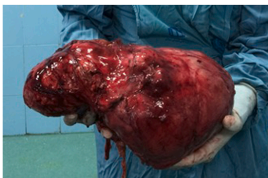
Fig. 3. The main bulk of the tumor.

the ligated area. The kidney was removed with no major bleeding. The weight of the main renal mass was 7500 gr. There were another two masses removed (sized 15-12-8 cm and 7-5-5 cm, weighted 900 gr and 600 gr) close to the renal mass as well (Fig. 3).