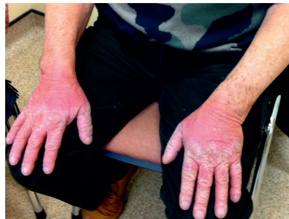
Figure 3 Photosensitive rash affecting light-exposed areas in a patient taking pirfenidone for 3 months during the winter in the North of England.

In the CAPACITY studies, 15% of patients discontinued treatment due to side effects. 17 Although this may seem high, it has been shown that between 4% and 26% of patients discontinue placebos due to perceived adverse events. 19 The level of adverse effects reported for pirfenidone is therefore not unusual in the context of a trial. Most of the patients who completed the CAPACITY trials were enrolled into an open-label extension study (RECAP) to evaluate the long-term safety of pirfenidone. 20 An interim analysis was published, reviewing data from enrollment in September 2008 until August 2013. The median duration of treatment was 163 weeks, with 99% of patients reporting at least one treatment-emergent adverse event. In more than one-third of patients, these included dyspnea, cough, or bronchitis, as well as upper respiratory symptoms of infection or nasopharyngitis. In total, 33% of patients also experienced nausea, with just less than one-third complaining of fatigue and dizziness. Rash and photosensitivity were less of a