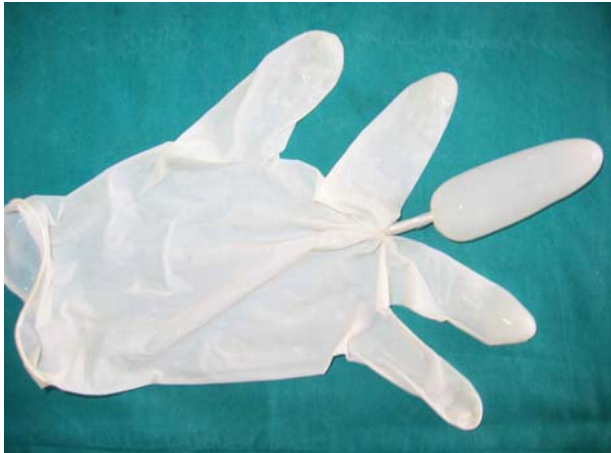
Figure 1 - Ice mould.

mean duration of procedure and mean threshold levels (Table-1).