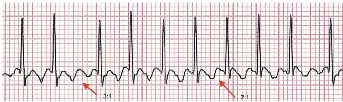
Figure 2 Electrocardiogram showing the “sawtooth” or “picket fence” pattern of atrial flutter, with 3:1 and 2:1 atrioventricular conduction in the D2 lead.

The diagnosis was confirmed after adenosine administration (50mcg/kg/dose), when the typical “sawtooth” or “picket fence” pattern was observed in the P wave, characteristic of atrial flutter, with 460 atrial contractions per minute (Fig. 2). The infant developed hemodynamic instability, weak pulses and slowed peripheral perfusion, thus being submitted to electrical cardioversion (0.5J/kg), with sinus rhythm return. Administration of amiodarone (5mg/kg) was initiated, and the newborn progressed with no new tachyarrhythmias, maintaining hemodynamic stability. The echocardiography performed on the day after cardioversion showed mild pulmonary hypertension and a 2.6-mm patent foramen ovale.