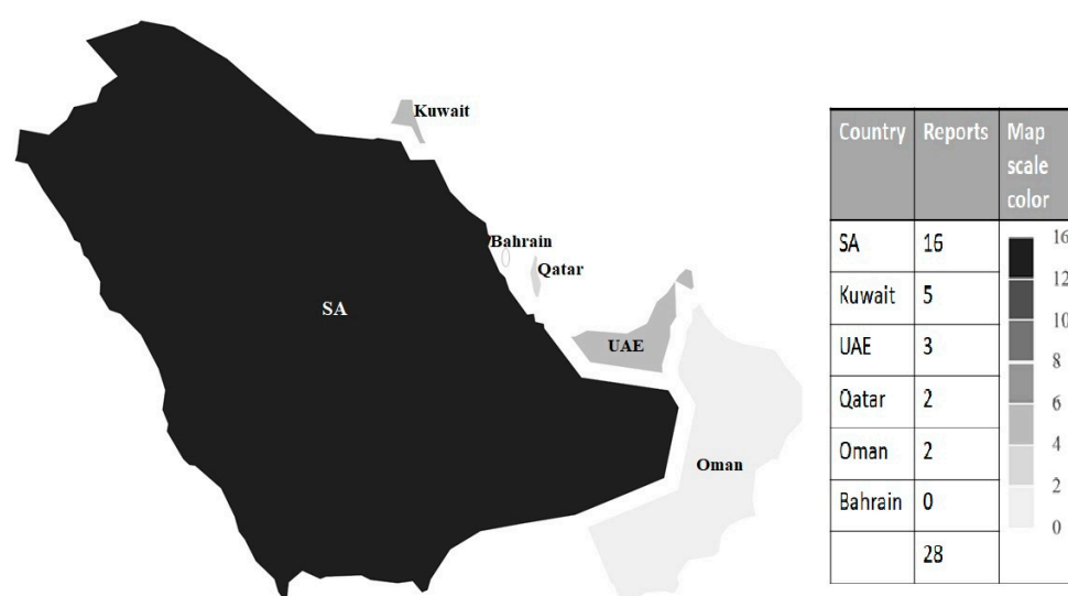
Figure 2. Distribution of Cryptosporidium reports in the GCC countries.

The allocation of Cryptosporidium reports in the GCC countries is presented in Figure 2. The burden of Cryptosporidium in the GCC countries is presented in Table 1. Molecular genotyping and sub-typing data of Cryptosporidium in Gulf reports are presented in Table 2. The situation of Cryptosporidium in water resources of the GCC countries is summarized in Table 3. Information on the Cryptosporidium occurrence in animals within the GCC countries is tabulated in Table 4. The results that are indicated in the figure and tables are described below.