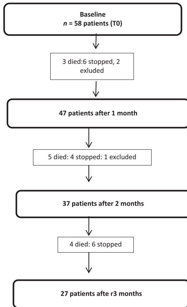
FIGURE 1 Flow diagram illustrating participating patients and dropout

Patients' characteristics at baseline are shown in Table 1. Mean age for men was significantly higher (62 years) than for women