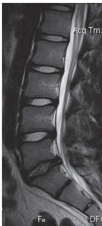
FIGURE 2: A 15-year-old male with disc bulging in the lower lumbar spine and a disc hernia at L5-S1 level, on sagittal T2WI.