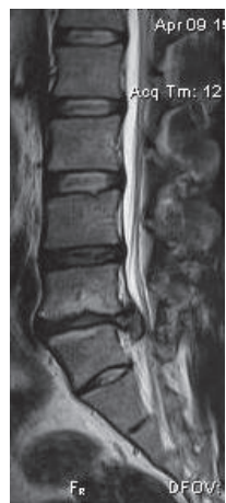
FIGURE 3: A 17-year-old male with an extensive descending disc hernia at L5-S1 level, with root impingement and severe degenerative endplate changes, on sagittal T2WI.

diseases, such as tumors, Chiari I malformation, intradural and extradural cysts, tethered cord, syringohydromyelia, and vertebral anomalies [8]. In our series only one female patient showed severe scoliosis, while kyphosis was secondary to Scheuermann's disease in all cases.