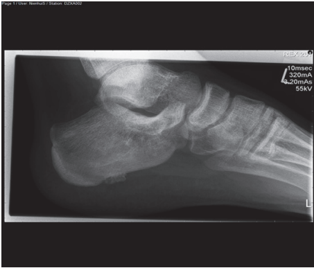
FIGURE 1: Plain radiograph: lateral view of the left foot: osteochondroma located at the plantar side of the calcaneal bone.