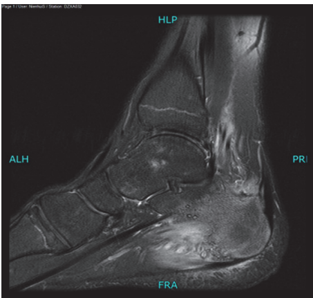
FIGURE 2: MRI T2 fat suppression: sagittal view of the left foot: high signal intensity of the soft tissue close to the plantar fascia. Secondary edema of bone marrow in the calcaneal bone.