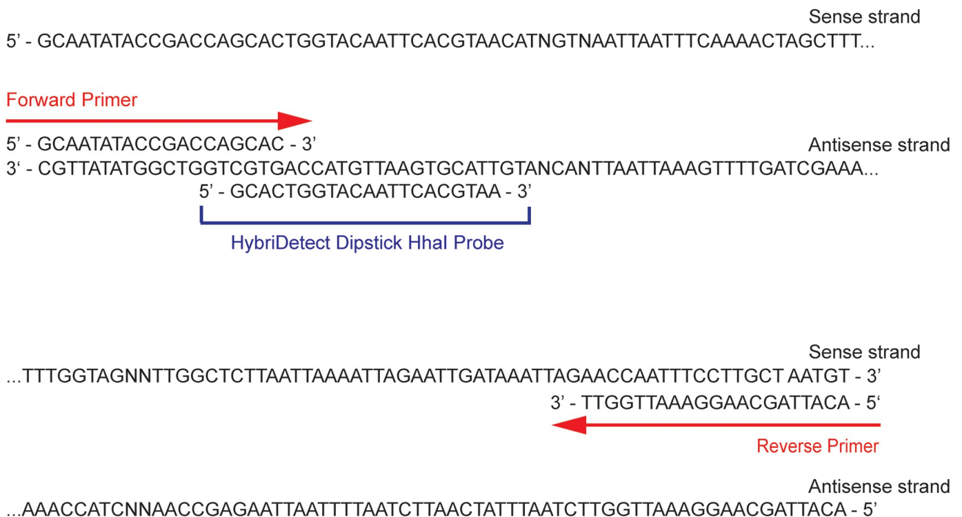
Fig 1. B. malayi HhaI repeat DNA sequence used for test strip-based detection. The sequence of B. malayi DNA that is amplified from the HhaI repetitive target is illustrated. Both the forward and reverse primer sites, as well as the location of the hybridization probe are indicated.

Probe hybridization and test strip detection. Following conventional PCR amplification of each sample using both the standard PCR and the miniPCR instruments in parallel, the 5'