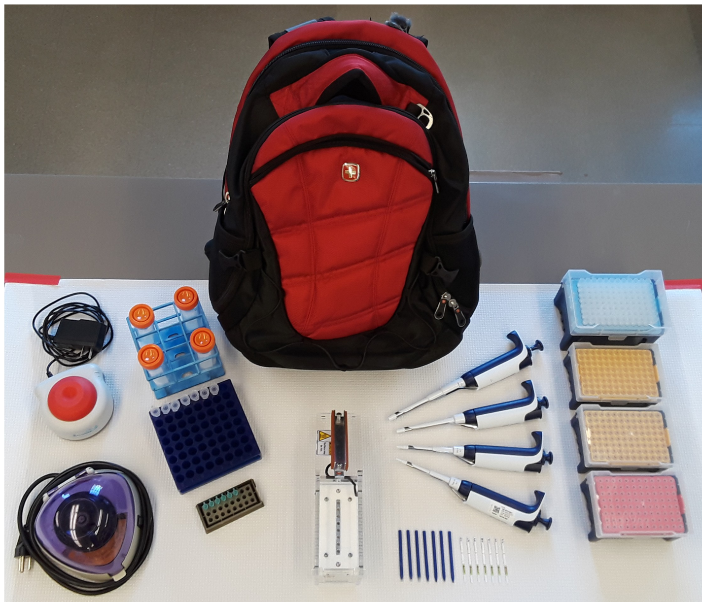
Fig 3. The contents of the “Backpack PCR” platform. The entire “Backpack PCR” platform weighs less than 10 lbs and can be easily transported by a single person. The “Backpack PCR” platform, which couples a simple and inexpensive NaOH-based extraction method with miniPCR amplification and test strip detection, will facilitate the use of molecular xenomonitoring in resource-limited settings. Furthermore, as this platform is based upon commercially available technologies, it will prove readily adaptable to the detection of W. bancrofti and other mosquito-borne pathogens. Research to develop this platform for the detection of other parasite and viral pathogens found in mosquitos is ongoing in our laboratory.

https://doi.org/10.1371/journal.pntd.0006962.t003