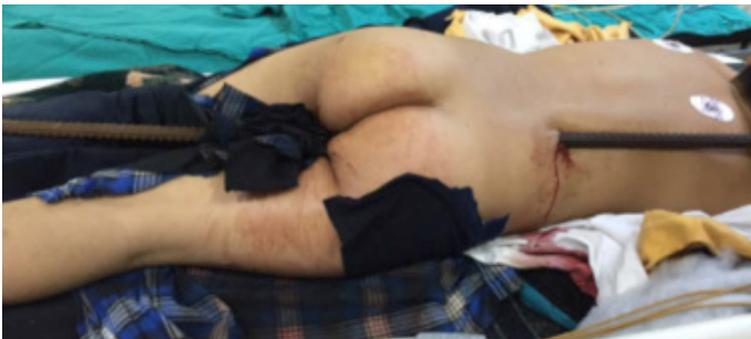
FIGURE 1. Penetrating injury caused by construction iron.

The main goal of the intervention was to shorten the iron bar to avoid more injuries to the tissues while removing the 18-mm wide ribbed construction iron bar; however, as appropriate tools to cut an iron bar was not available at our hospital, the fire department was urgently called. The fire department reported that they had three types of bar cutters: the scissor-type cutter would cause more injuries to the patient and the other was a spiral cutter that cannot cut such a bar; therefore, these two cutters were not suitable for this task. The third type was a spiral-type cutter that can cut the iron by transmitting heat. Inevitably, this cutter was used, and cold water was