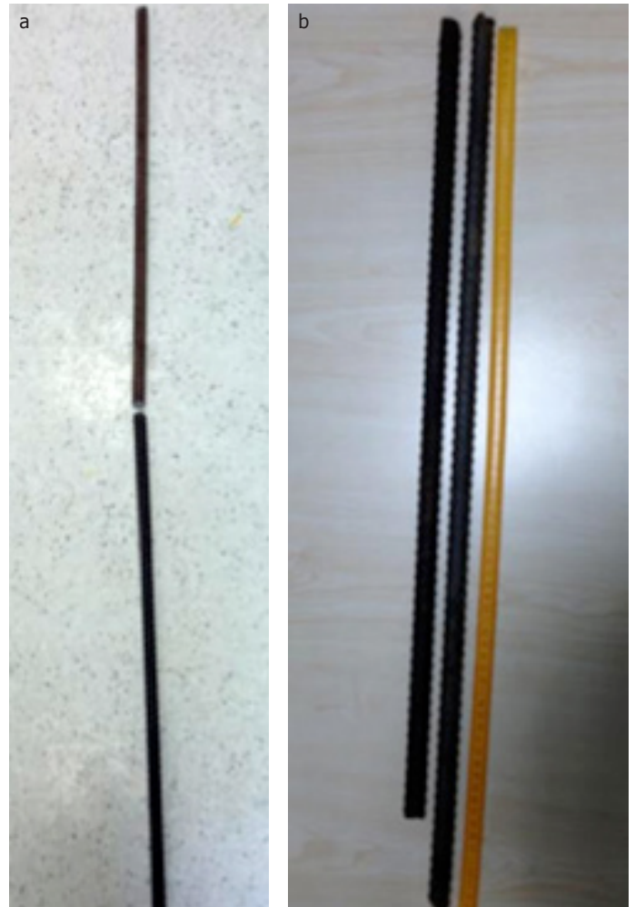
FIGURES 3A,B. The shortened 140-cm iron bar was pulled in a controlled manner and removed.