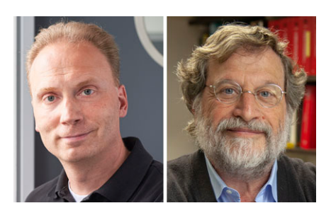
Insights from Falk Nimmerjahn and Jeffrey V. Ravetch.

In their paper, Grey and Kunkel (1964) made use of the fact that patients with multiple myeloma are characterized by an expansion of a single malignant B cell clone secreting large amounts of one intact IgG molecule or a single antibody light chain (also known as Bence Jones protein), respectively. By injecting purified 7S \gamma myeloma proteins obtained from different patients into rabbits, they were able to raise rabbit antisera directed against different human 7S \gamma myeloma proteins. Using these