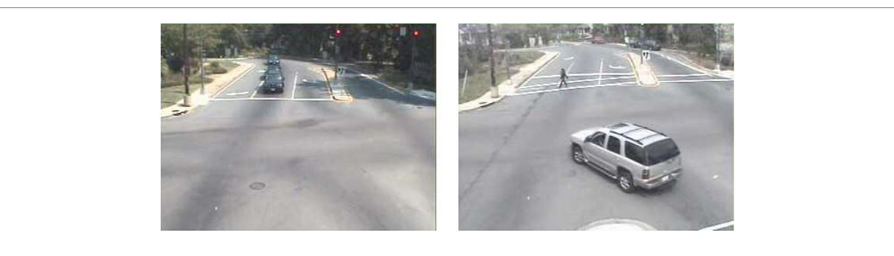
FIGURE 1 | Residential intersection prior to (left) and following (right) built environment change.