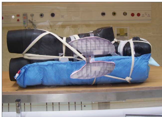
Figure 2: Position of Styrofoam Shield Template on Beam Spoiler in Verification Radiography