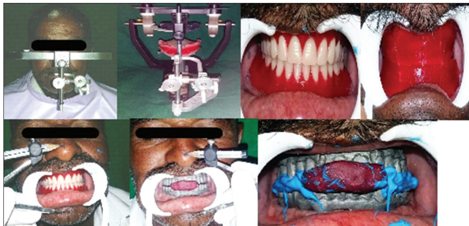
Figure 3: Facebow record was made (upper left), vertical dimension at occlusion was checked (lower left), teeth arrangement was made (upper right), and metal framework was made and checked with the same vertical dimension at occlusion (lower right)