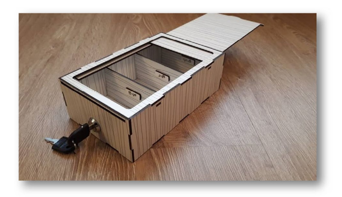
FIGURE 2 Medication box for intervention group

At this stage, the patient's oral medications were placed in the box for the next two days so that they could take full responsibility for