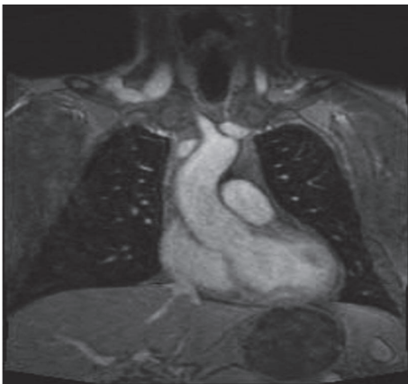
FIGURE 2: MRI of the heart with and without intravenous gadolinium contrast administration.