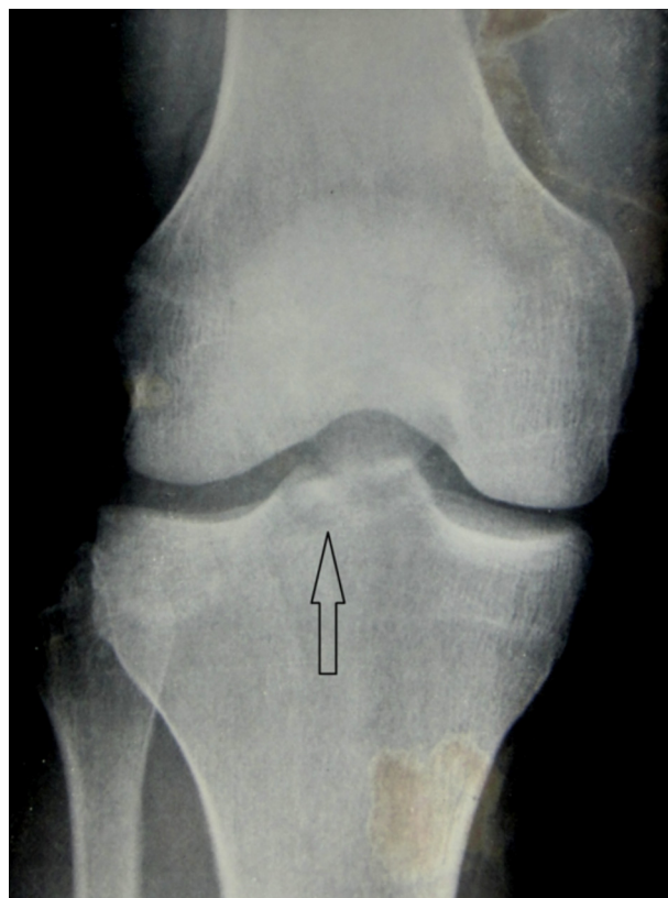
Fig. 2 – Lateral radiograph of the knee (arrow).

II for the avulsion of the posterior cruciate ligament. Because of the magnitude of the fragment displacement (the posterior fragment extended to the tibial plateau) and the time that had elapsed since the trauma, it was decided to perform open reduction of both avulsions.