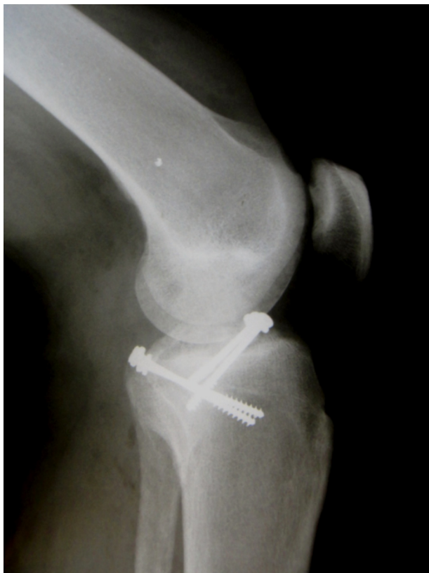
Fig. 6 – Radiograph of the knee six months after the operation, showing anatomical reduction and consolidation.

more frequently than the posterior tibial insertion. 5 When an avulsed fragment is displaced, primary fixation is indicated in order to prevent anterior impact in extension, residual laxity and non-consolidation of fragments and preservation of the native ACL. Several surgical treatments have been proposed for these injuries, going from the conventional open procedure to inclusion of arthroscopic methods, which were first described by McLennan in Ochiai et al. in 1982, 6 with a number of fixation methods: Kirschner wires, cannulated screws, sutures with steel or polyester wires, anchors and EndoButton®. While the results from primary fixation in skeletally immature patients are good, the treatments in adults present variable results, and some authors have reported high rates of incidence of postoperative complications. 3